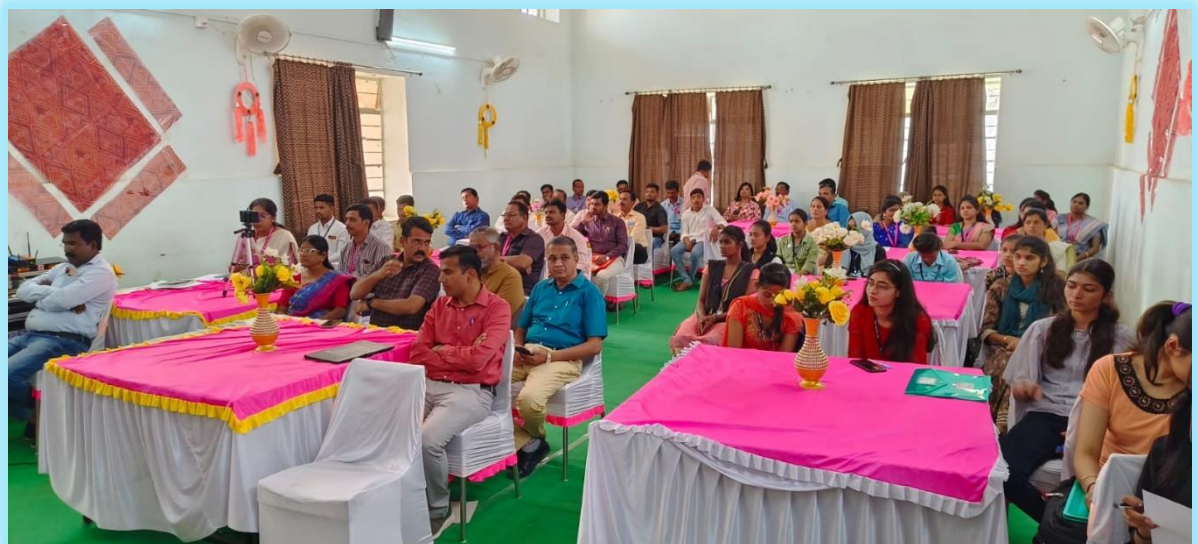
Participants in the Workshop